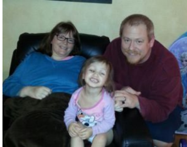
The Antone Family

Welcome to our Pulse Gives Back Sponsorship Page!